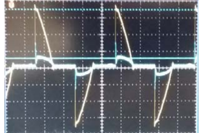
50% Dim Level Waveform Capture